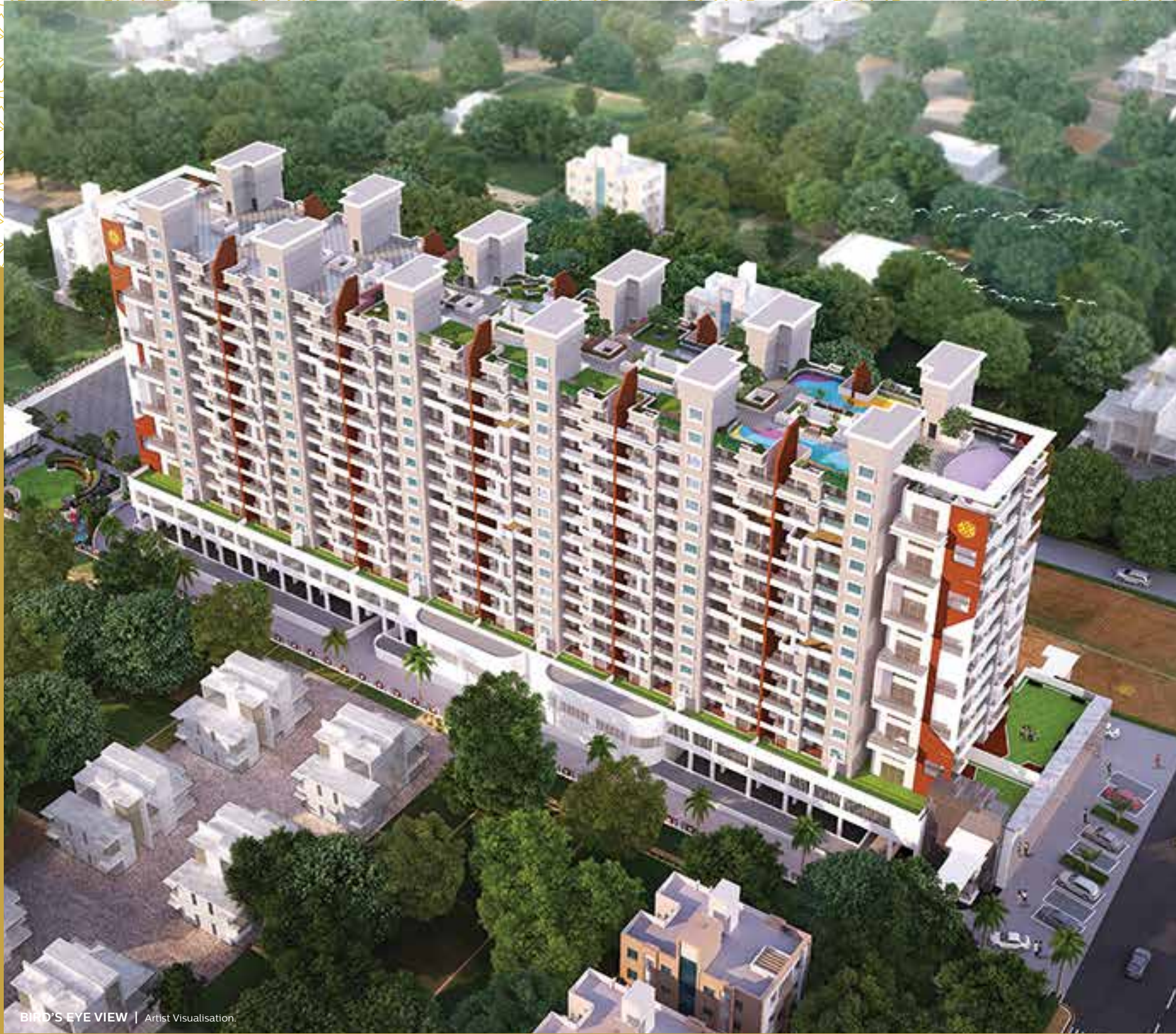
BIRD'S EYE VIEW | Artist Visualisation.