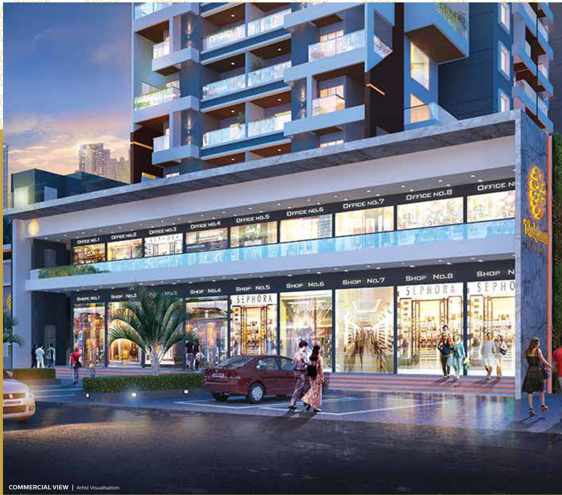
COMMERCIAL VIEW | Artist Visualisation.