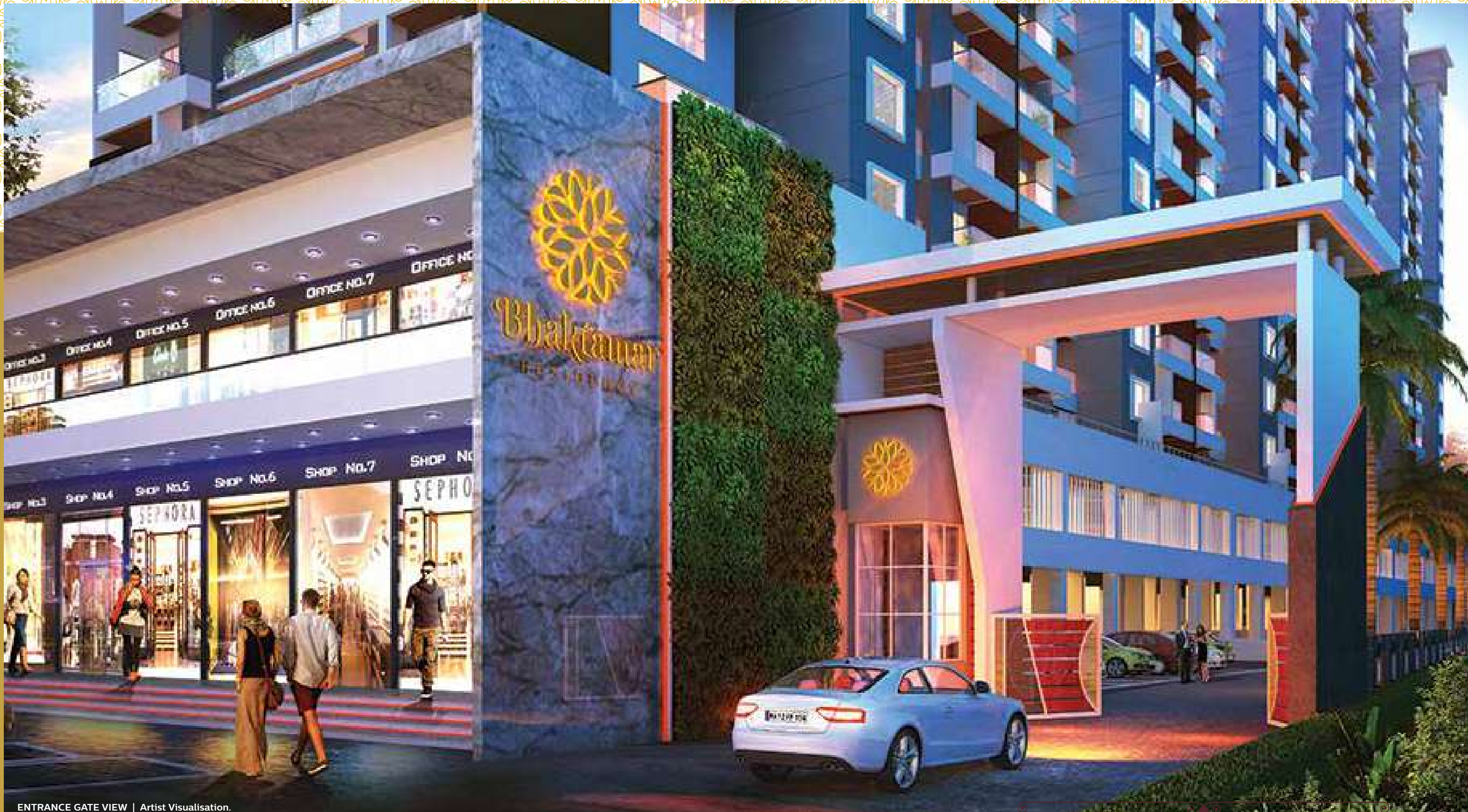
ENTRANCE GATE VIEW | Artist Visualisation.

Disclaimer: The intent of this advertising collateral is to provide only preliminary information about the project. By accepting the same you have agreed that your purchase decision will be made only after satisfactorily examining and understanding the entire project, its relevant documents including but not limited to examining the sanctioned plans, permission, property title, amenities, specifications, FSI statements, phase-wise development plan, project location, agreement, possession date etc. The developer reserves the right to change, amend and modify the architectural specifications during development stages. Amenities and features of the project mentioned hereby are subject to change(s)/deletion at the discretion of the company. A copy of detailed sanction plans and other documents are available for reference in our corporate office.