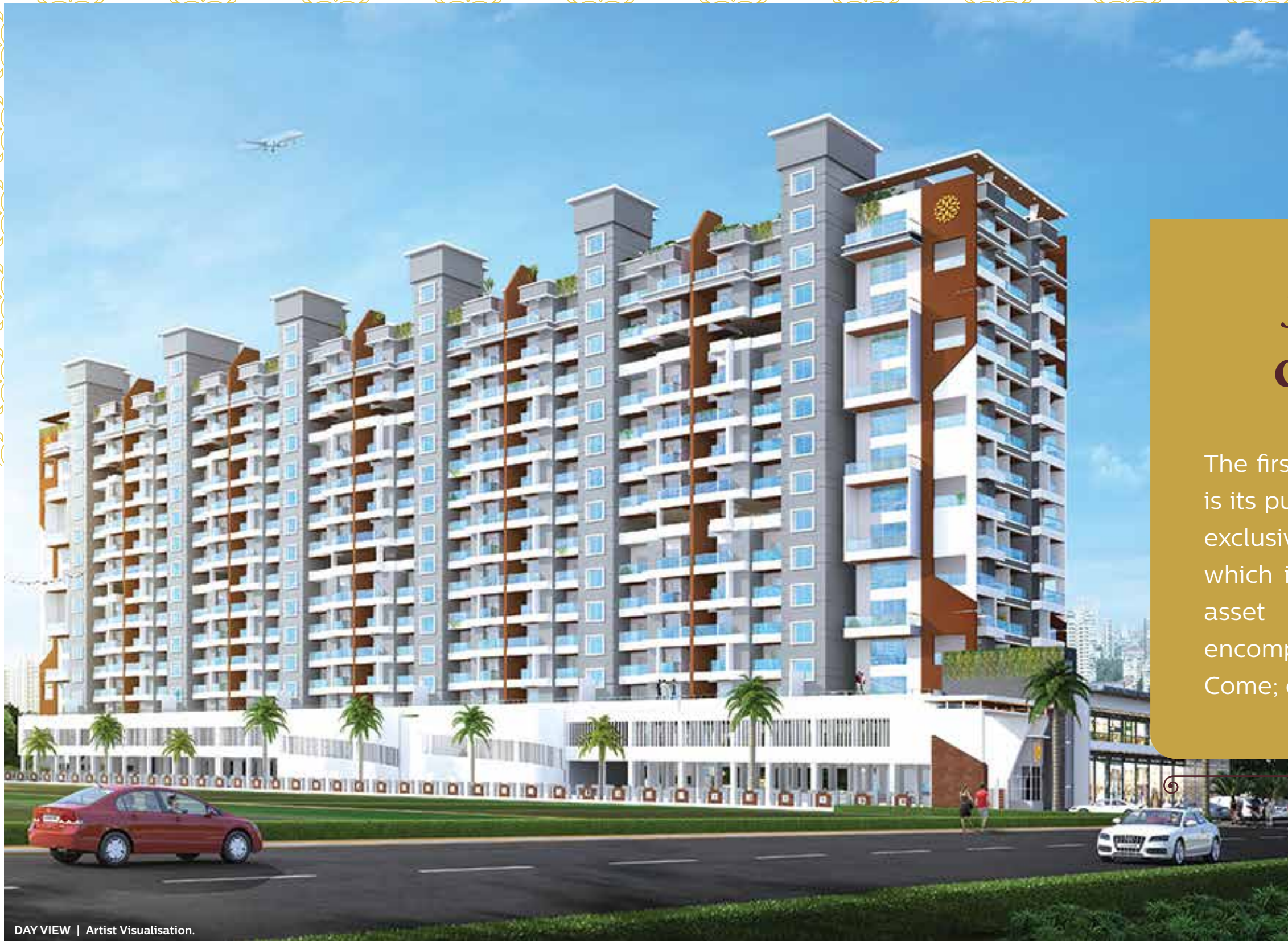
DAY VIEW | Artist Visualisation.