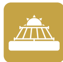
SOLAR WATER SYSTEM