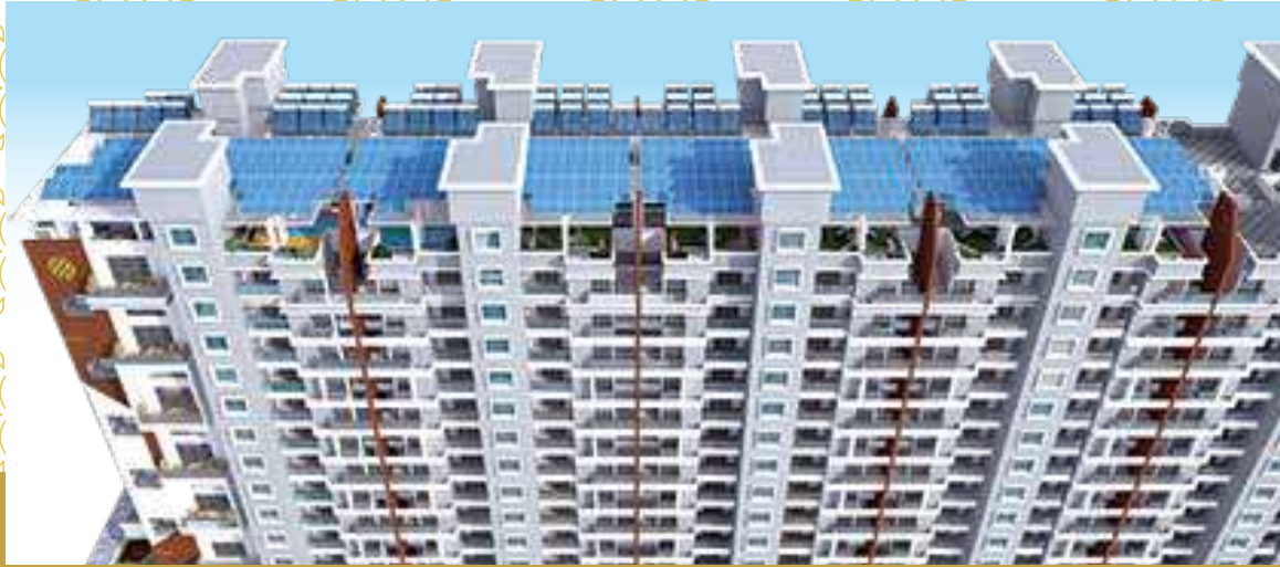
SOLAR PANELS ABOVE ROOFTOP GARDEN VIEW | Artist Visualisation.